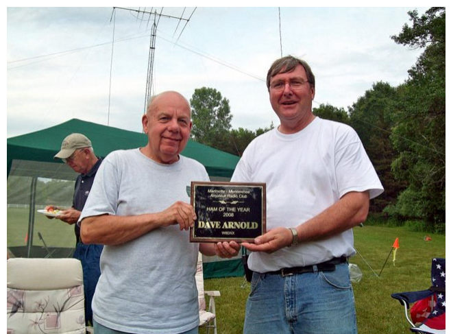
W8DXX gets his HOTY plaque from K8IR