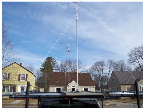
The NG9T/m antenna farm atop KG9GH's pickup, looking from the rear. That's 80 meters over the bed, 40/20/15 on top of the cab, and 75 on the hood.

Jim, K8IR with driver Eric, KG9GH activated 18 counties as NG9T/mobile, logging over 800 QSO's. They currently have the highest posted Single-Op score, mobile or fixed.