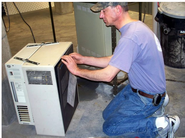
KG9GH locks up the new repeater after installation. The duplexer is mounted on the back of the radio for a neat, compact installation, courtesy of Eric.