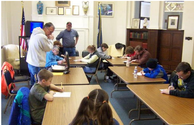
Candidates testing under the watchful eyes of the VE'S.

A snowstorm almost wiped out the scheduled testing session March 19 th at the Stephenson Public Library, but a dozen prospects were able to test that day, with four new technicians and two general upgrades resulting.