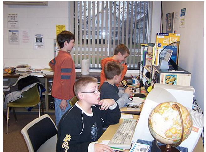
A busy afternoon in the DAR Radio Room

On January 31, 2007, the W8PIF DAR ham radio station will be celebrating its first year of operation. Several activities are planned for Wednesday January 31st through Friday February 2nd. A special event station with the call K8D ( K IDS 8 D AR) will be on the air starting around noon on January 31st, and will feature many DAR "Ham-mers" as operators throughout the event schedule.